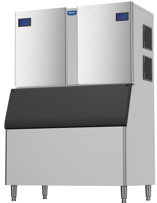
Output:681kg/24h Color:Stainless steel

Crafted for premium commercial settings, this split-type ice maker redefines ice production with its signature crescent-shaped cubes. The innovative separated structure enhances spatial flexibility and cooling efficiency while maintaining a sleek design. It consistently delivers crystal-clear, slow-melting crescent ice that naturally hugs the glass—keeping drinks colder longer without diluting their flavor. The elegant, shimmering arc adds visual appeal to cocktails, whiskey, coffee, and tea. Easy to maintain and clean, it's an ideal choice for bars, specialty cafes, modern tea houses, and upscale events.