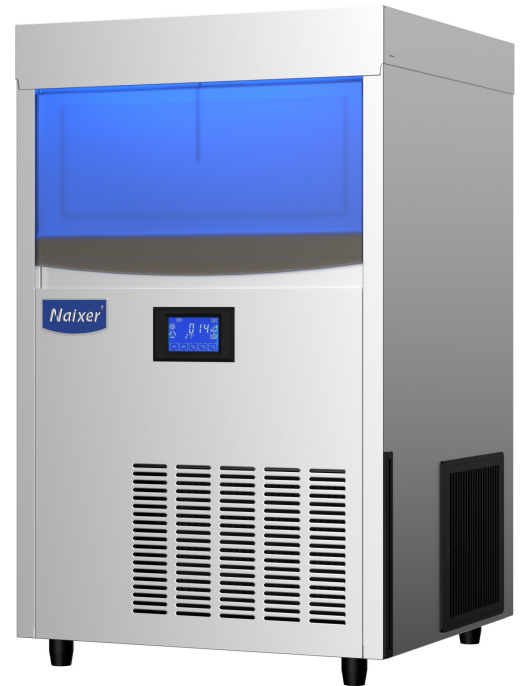
Output:70kg/24h Color:Stainless steel

Crafted for perfectionists who demand both elegance and performance, the Crystal Column Pro redefines commercial and premium ice production. This sophisticated all-in-one unit is engineered to produce exceptionally clear, slow-melting octagonal cylinder ice—the gold standard for premium beverages. The octagonal cylinder offers a greater surface area than a standard cube, chilling drinks faster while melting slower. Its elegant, faceted design catches the light beautifully, making it the centerpiece of any high-end cocktail, whiskey on the rocks, or champagne bucket at an outdoor wedding.