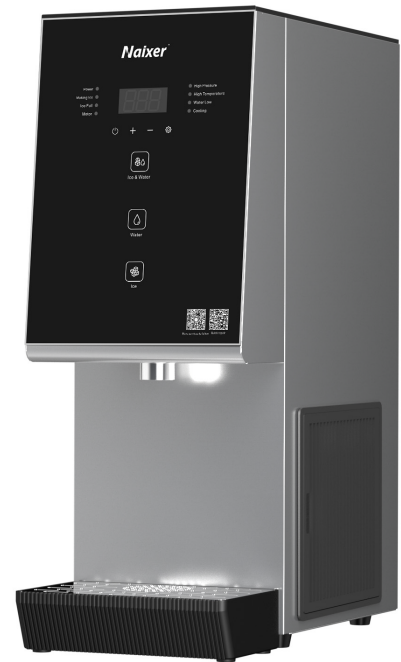
Output: 60kg/24h Color:Stainless steel

Commercial Ice & Water Dispenser | One-Touch Perfection, Chill Redefined Designed for premium dining and leisure venues, this intelligent dispenser features a triple-mode system that effortlessly switches between ice-only, chilled water, and ice-water blend at the touch of a button. With adjustable ice thickness (1-3 settings), it creates the ideal nugget ice—firm yet yielding, with 10% moisture content—to cool drinks rapidly without diluting their authentic flavor.